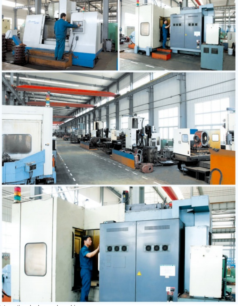
International advanced machine